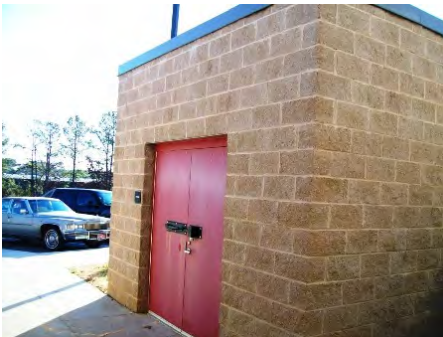
28-Jan-2011 North Elevation

Current Repair Cost: $0.00 Replacement Cost: $21,247.72 FCI: 0.00%