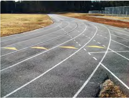
28-Jan-2011 Track at Stone Mountain Middle School

Current Repair Cost: $0.00 Replacement Cost: $543,338.11 FCI: 0.00%