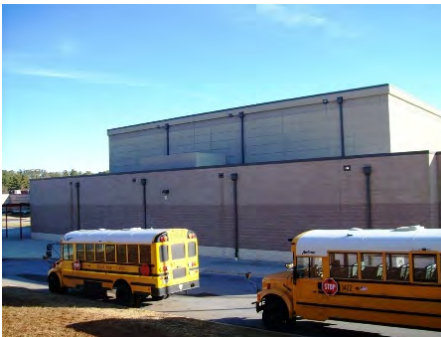
28-Jan-2011 West Elevation