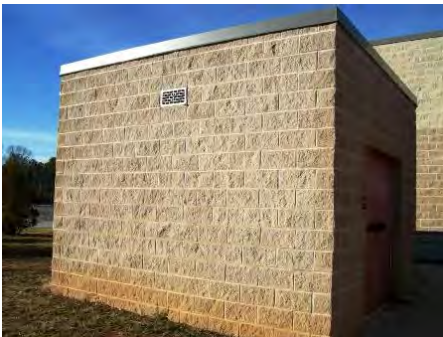
28-Jan-2011 East Elevation