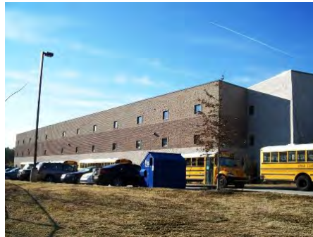
28-Jan-2011 East Elevation