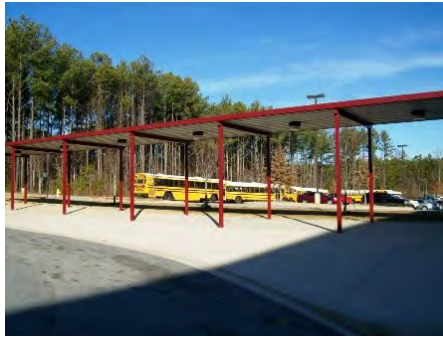
28-Jan-2011 South Elevation