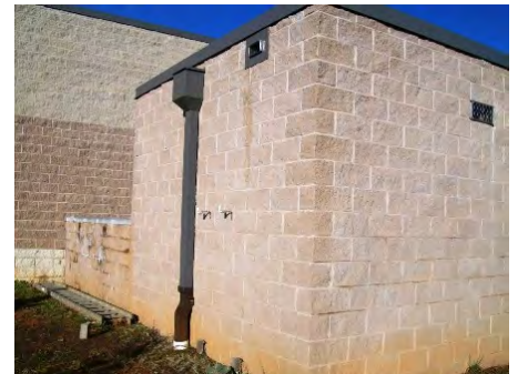
28-Jan-2011 South Elevation