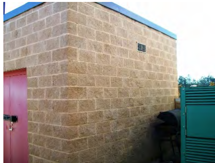
28-Jan-2011 West Elevation