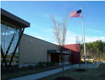
28-Jan-2011 North Elevation