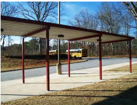
28-Jan-2011 North Elevation