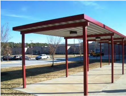
28-Jan-2011 West Elevation

Current Repair Cost: $0.00 Replacement Cost: $43,120.58 FCI: 0.00%