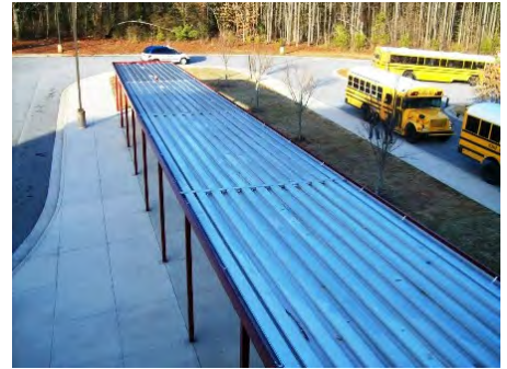
28-Jan-2011 East Elevation