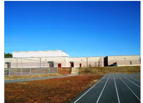
28-Jan-2011 South Elevation