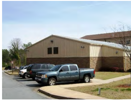
07-Mar-2011 North Elevation