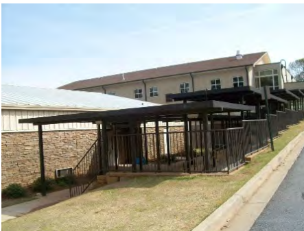
07-Mar-2011 North Elevation