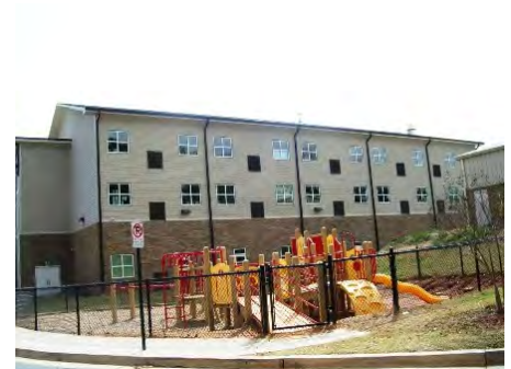
07-Mar-2011 Northeast Elevation