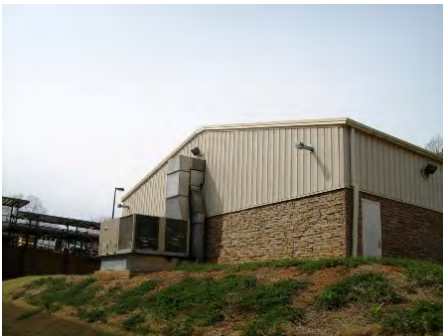
07-Mar-2011 South Elevation