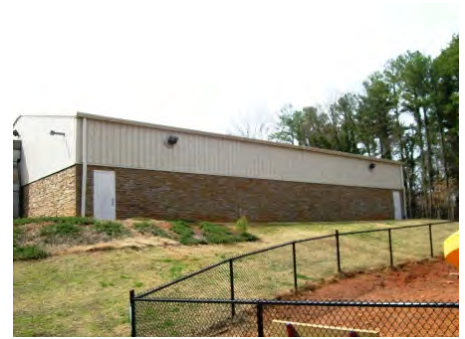
07-Mar-2011 East Elevation