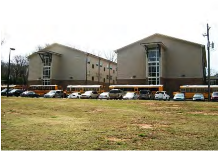
07-Mar-2011 East Elevation