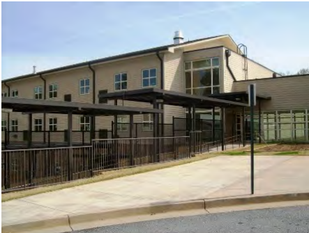
07-Mar-2011 Northwest Elevation

Current Repair Cost: $0.00 Replacement Cost: $71,867.64 FCI: 0.00%