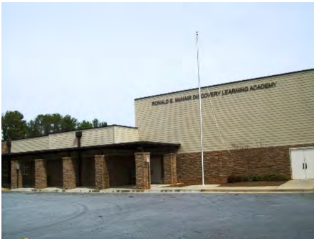
07-Mar-2011 Southwest Elevation