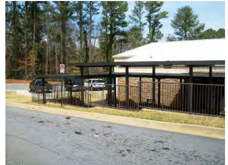
07-Mar-2011 West Elevation