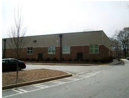
07-Mar-2011 North Elevation