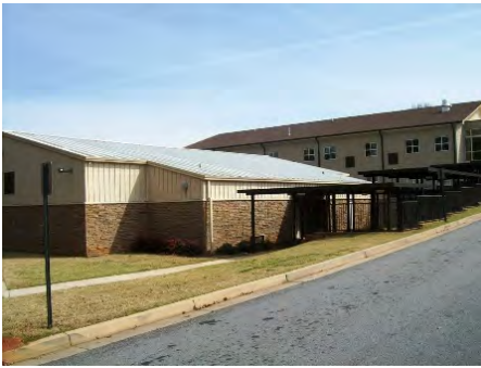
07-Mar-2011 Northwest Elevation