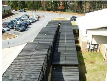
07-Mar-2011 South Elevation