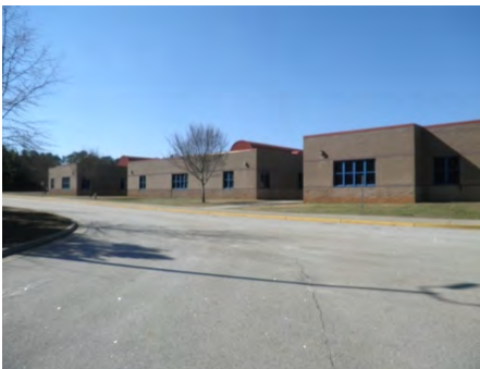
08-Feb-2011 East Elevation