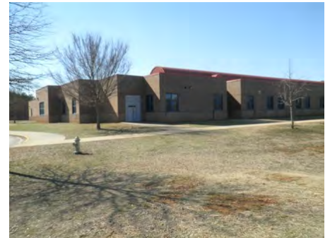
08-Feb-2011 Northeast Elevation