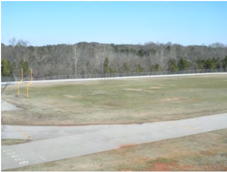
08-Feb-2011 Football Field at Mary McLeod Bethune Middle School