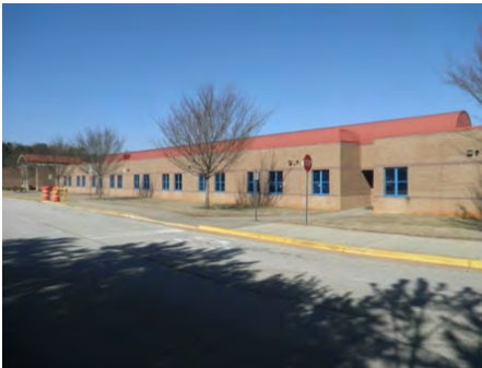
08-Feb-2011 South Elevation