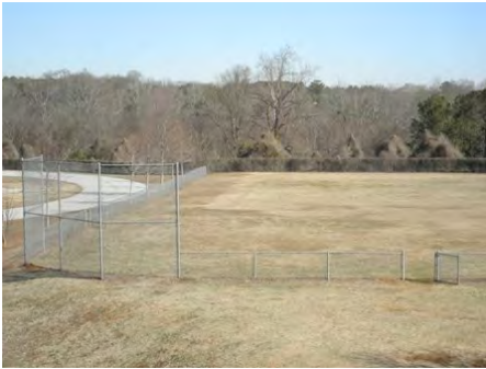
08-Feb-2011 Baseball Field at Mary McLeod Bethune Middle School