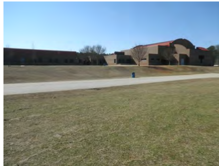
08-Feb-2011 North Elevation