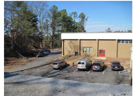
24-Jan-2011 North Elevation