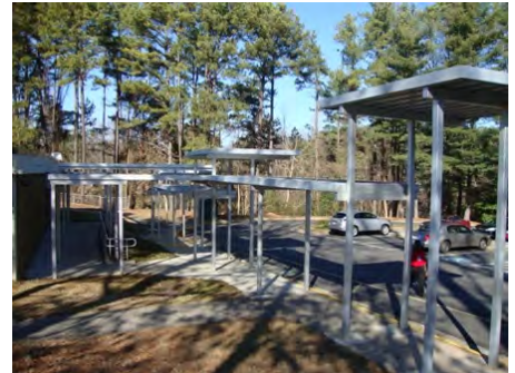
24-Jan-2011 West Elevation