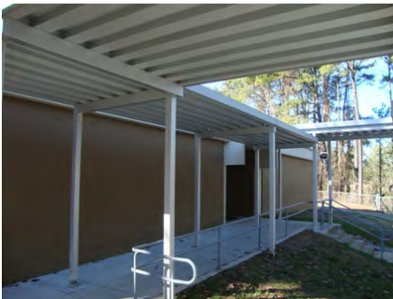
24-Jan-2011 East Elevation