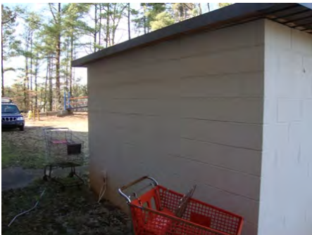
24-Jan-2011 South Elevation