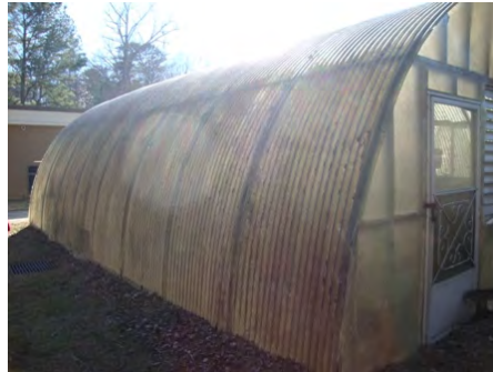
24-Jan-2011 East Elevation