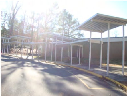
24-Jan-2011 East Elevation

Current Repair Cost: $0.00 Replacement Cost: $37,315.89 FCI: 0.00%