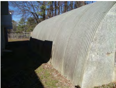
24-Jan-2011 West Elevation