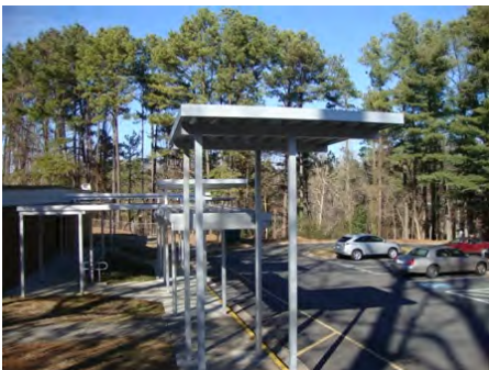
24-Jan-2011 South Elevation