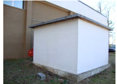
24-Jan-2011 East Elevation