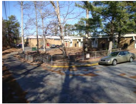
24-Jan-2011 West Elevation