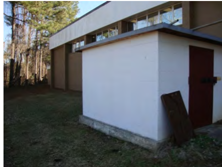
24-Jan-2011 North Elevation