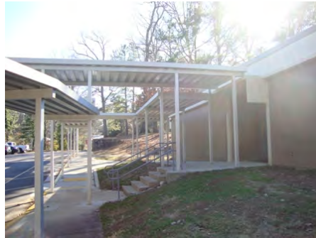
24-Jan-2011 North Elevation