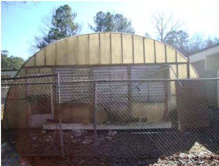
24-Jan-2011 North Elevation

Current Repair Cost: $0.00 Replacement Cost: $60,005.16 FCI: 0.00%