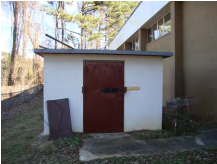
24-Jan-2011 West Elevation

Current Repair Cost: $0.00 Replacement Cost: $11,407.77 FCI: 0.00%