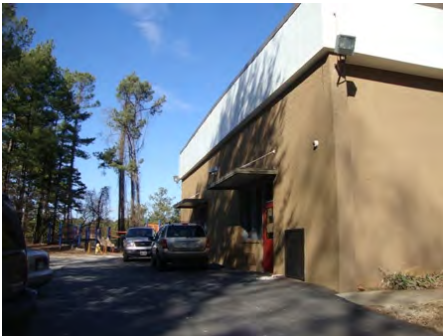
24-Jan-2011 West Elevation