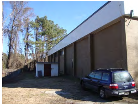
24-Jan-2011 North Elevation