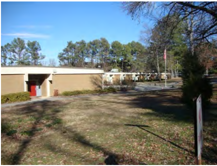
24-Jan-2011 South Elevation