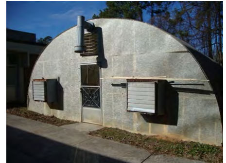
24-Jan-2011 South Elevation