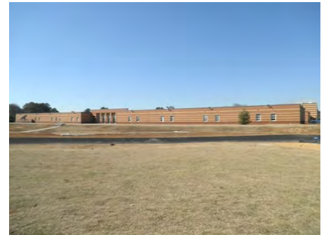
24-Jan-2011 Southeast Elevation