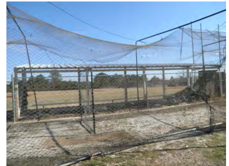
24-Jan-2011 West Elevation