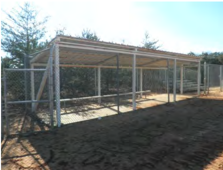
24-Jan-2011 North Elevation

Current Repair Cost: $0.00 Replacement Cost: $16,950.37 FCI: 0.00%