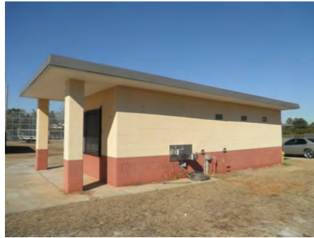
24-Jan-2011 Southeast Elevation