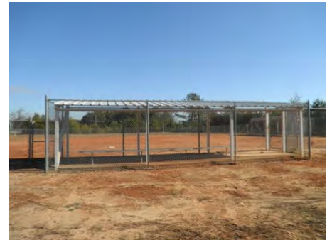
24-Jan-2011 West Elevation