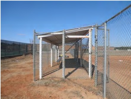
24-Jan-2011 South Elevation