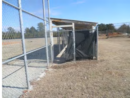
24-Jan-2011 West Elevation