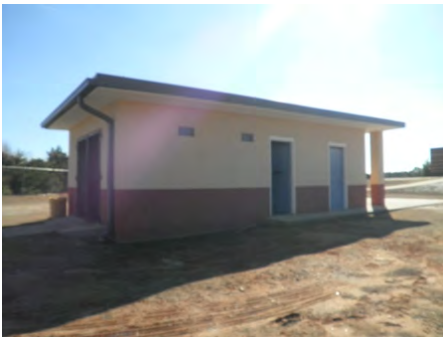
24-Jan-2011 Northwest Elevation