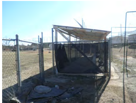
24-Jan-2011 North Elevation