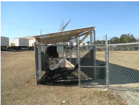
24-Jan-2011 East Elevation