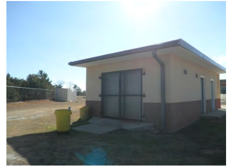
24-Jan-2011 Northeast Elevation