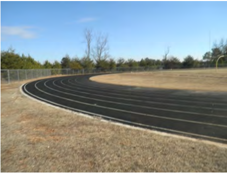
24-Jan-2011 Track at Lithonia High School