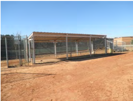
24-Jan-2011 East Elevation

Current Repair Cost: $0.00 Replacement Cost: $16,950.37 FCI: 0.00%