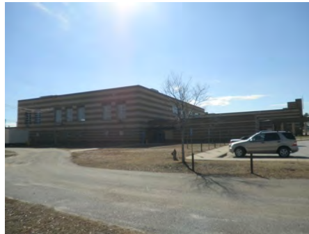
24-Jan-2011 Northeast Elevation