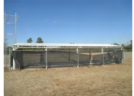
24-Jan-2011 South Elevation