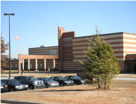
24-Jan-2011 Lithonia High School