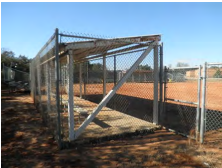
24-Jan-2011 East Elevation