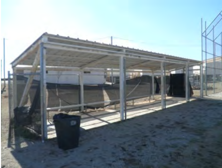
24-Jan-2011 North Elevation

Current Repair Cost: $0.00 Replacement Cost: $26,484.96 FCI: 0.00%