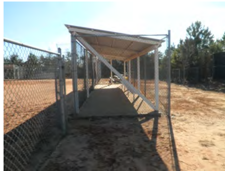
24-Jan-2011 North Elevation