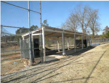
24-Jan-2011 East Elevation

Current Repair Cost: $0.00 Replacement Cost: $26,484.96 FCI: 0.00%