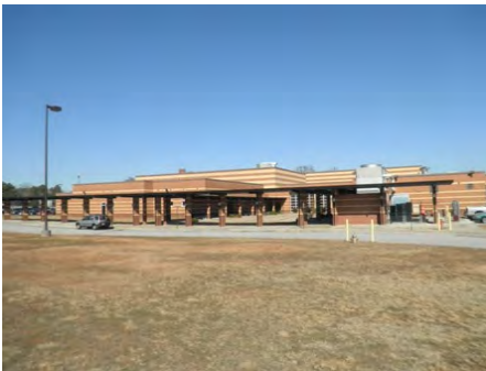
24-Jan-2011 Southwest Elevation