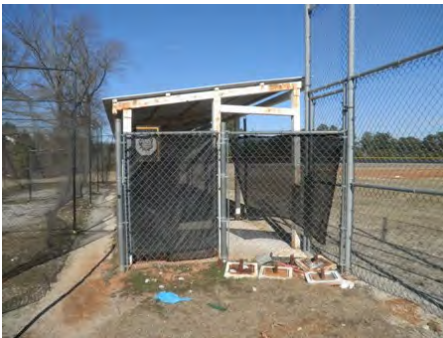
24-Jan-2011 South Elevation