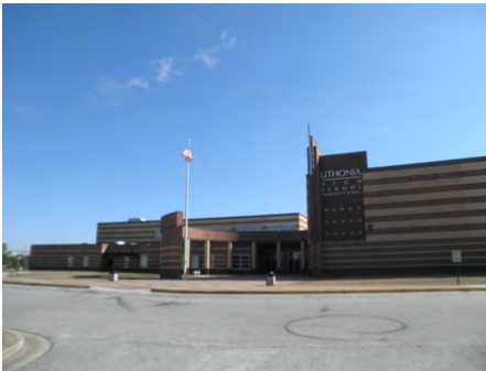
24-Jan-2011 Northwest Elevation