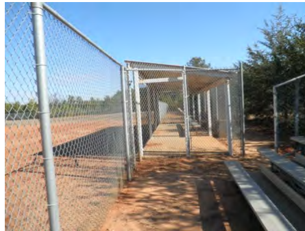
24-Jan-2011 West Elevation