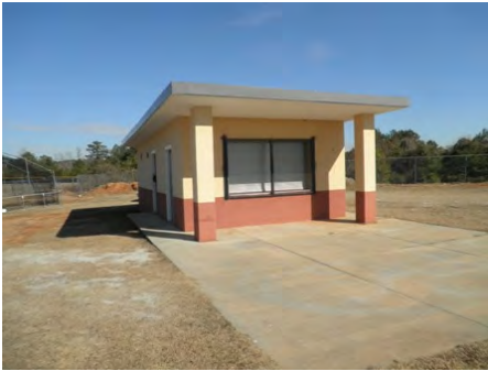
24-Jan-2011 Southwest Elevation

Current Repair Cost: $0.00 Replacement Cost: $104,049.79 FCI: 0.00%