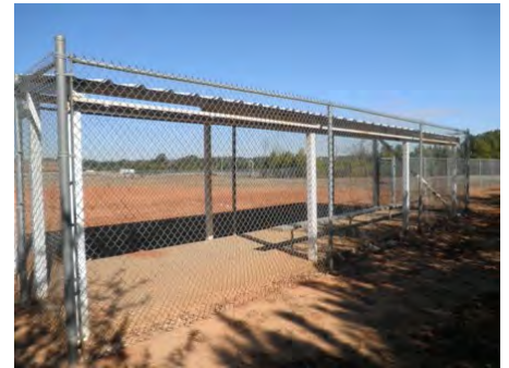
24-Jan-2011 South Elevation