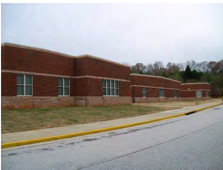
08-Dec-2010 North Elevation