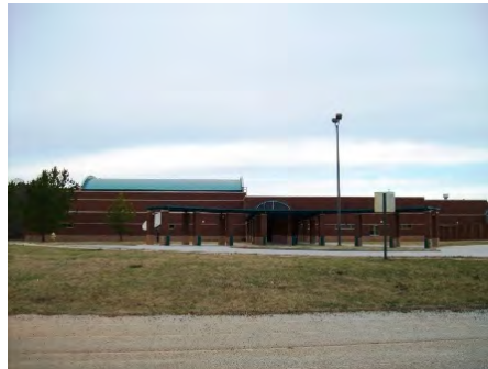
08-Dec-2010 South Elevation