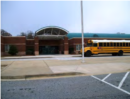
08-Dec-2010 Freedom Middle School