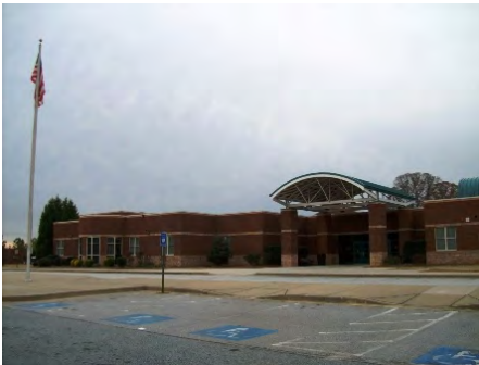
08-Dec-2010 East Elevation