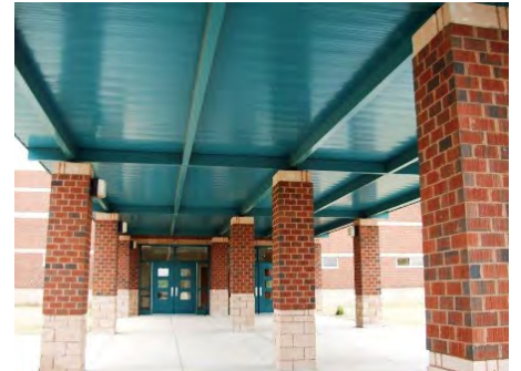
08-Dec-2010 Southeast Elevation