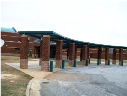
08-Dec-2010 South Elevation