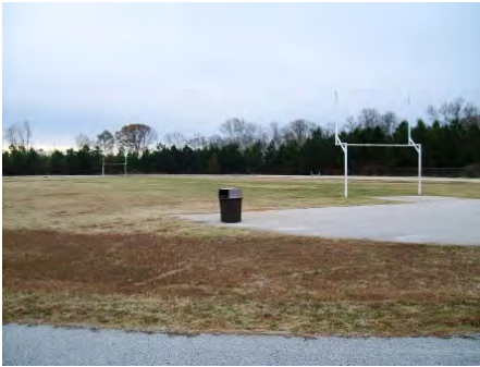
08-Dec-2010 Football Field at Freedom Middle School