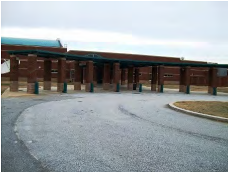
08-Dec-2010 Southwest Elevation