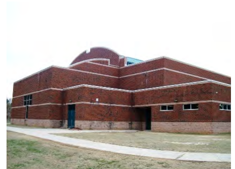
08-Dec-2010 West Elevation