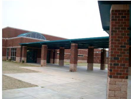
08-Dec-2010 West Elevation