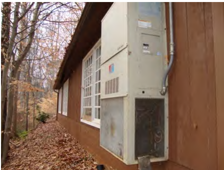
07-Mar-2011 South Elevation