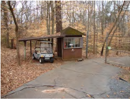
07-Mar-2011 North Elevation