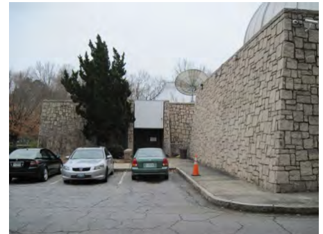
07-Mar-2011 North Elevation