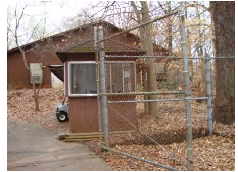
07-Mar-2011 West Elevation