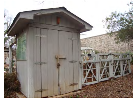
07-Mar-2011 South Elevation