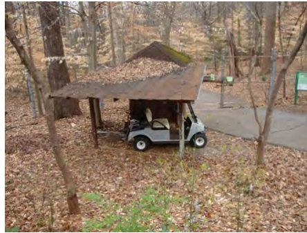
07-Mar-2011 East Elevation