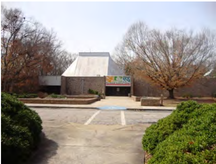
07-Mar-2011 East Elevation