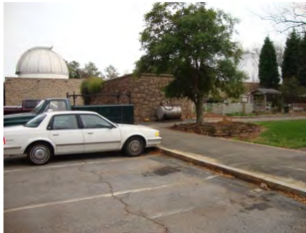
07-Mar-2011 West Elevation