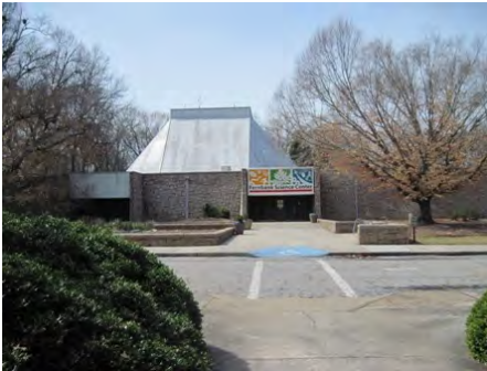
07-Mar-2011 Fernbank Science Center