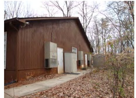
07-Mar-2011 West Elevation