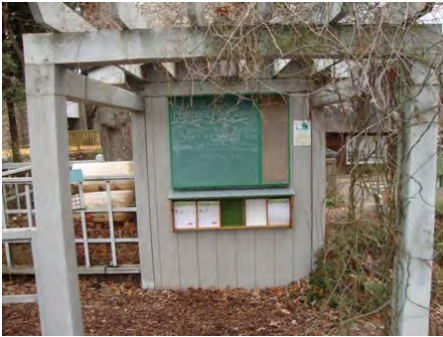
07-Mar-2011 West Elevation

Current Repair Cost: $0.00 Replacement Cost: $7,841.16 FCI: 0.00%