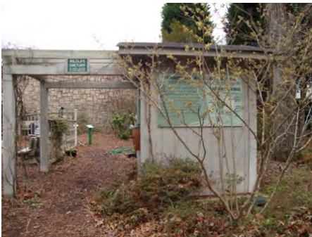
07-Mar-2011 North Elevation