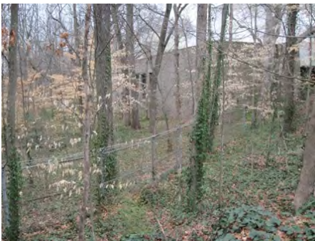
07-Mar-2011 South Elevation