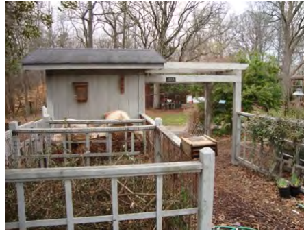
07-Mar-2011 East Elevation