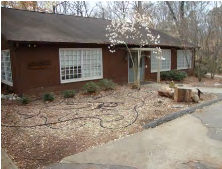
07-Mar-2011 North Elevation