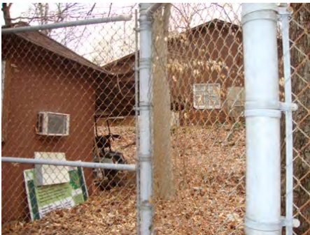
07-Mar-2011 South Elevation