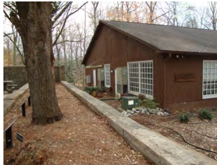
07-Mar-2011 East Elevation