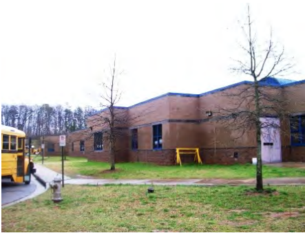
11-Mar-2011 North Elevation