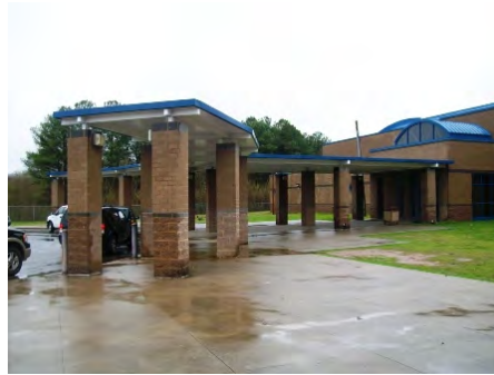
11-Mar-2011 East Elevation