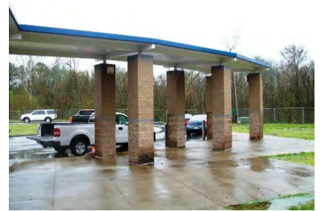
11-Mar-2011 North Elevation