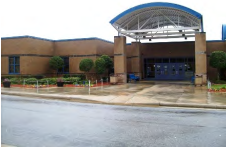
14-Mar-2011 Columbia Middle School