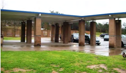
11-Mar-2011 West Elevation