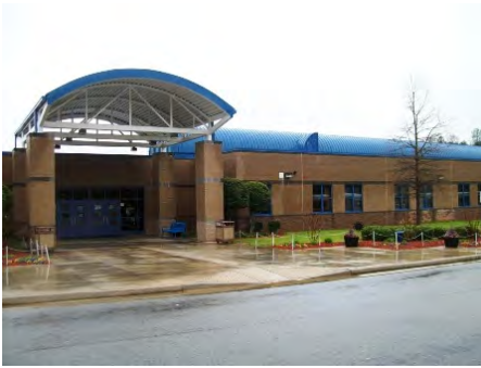
11-Mar-2011 East Elevation