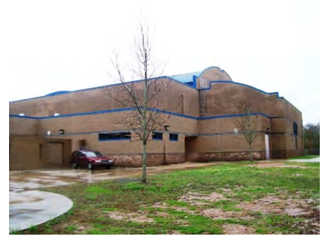
11-Mar-2011 West Elevation