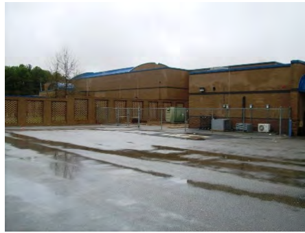
11-Mar-2011 South Elevation