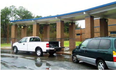
11-Mar-2011 South Elevation

Current Repair Cost: $0.00 Replacement Cost: $106,142.98 FCI: 0.00%