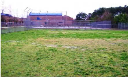
11-Mar-2011 Softball Field at Columbia Middle School

Current Repair Cost: $0.00 Replacement Cost: $519,850.80 FCI: 0.00%