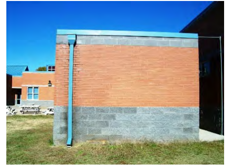
02-Dec-2010 South Elevation