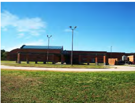
02-Dec-2010 East Elevation