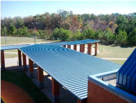
02-Dec-2010 West Elevation

Current Repair Cost: $0.00 Replacement Cost: $106,142.98 FCI: 0.00%