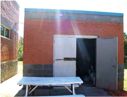
02-Dec-2010 North Elevation