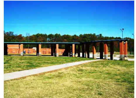
02-Dec-2010 South Elevation