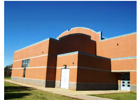
02-Dec-2010 South Elevation