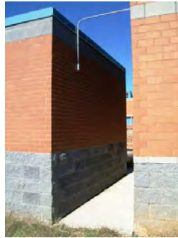
02-Dec-2010 East Elevation