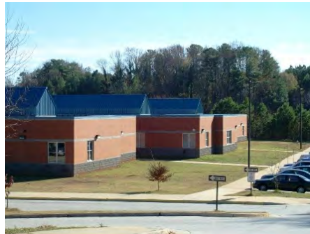
02-Dec-2010 West Elevation