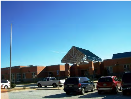
02-Dec-2010 Avondale Middle School