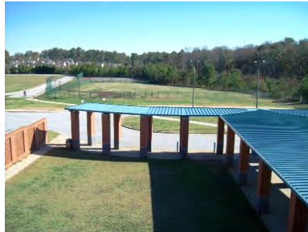
02-Dec-2010 West Elevation