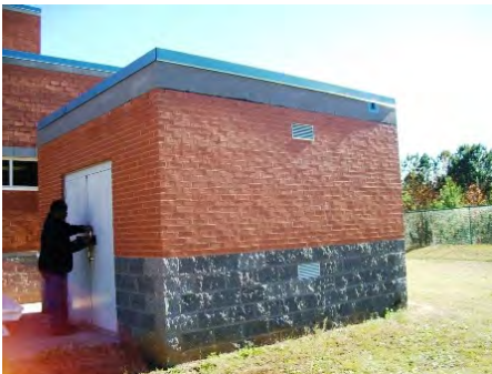
02-Dec-2010 West Elevation