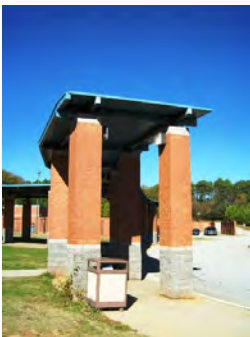
02-Dec-2010 South Elevation