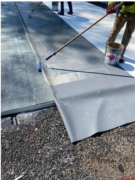
Installation of New Roof System