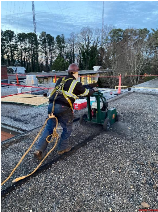
Demolition of Existing Roof