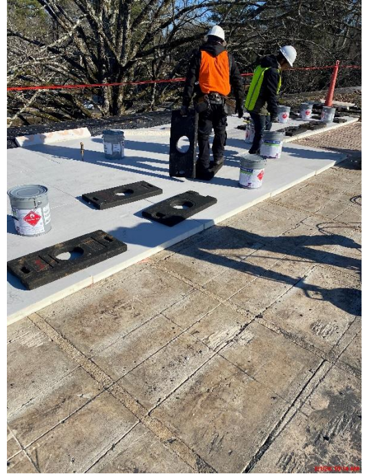
Installation of New Roof System