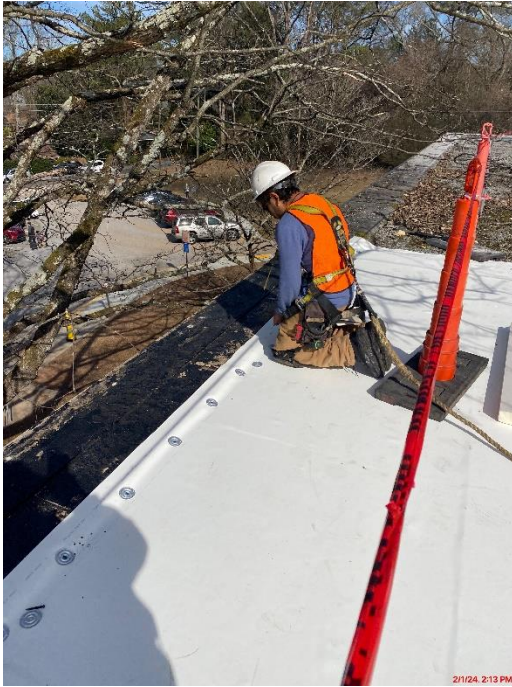
New Roof System